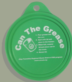
Three-tier Can Lid